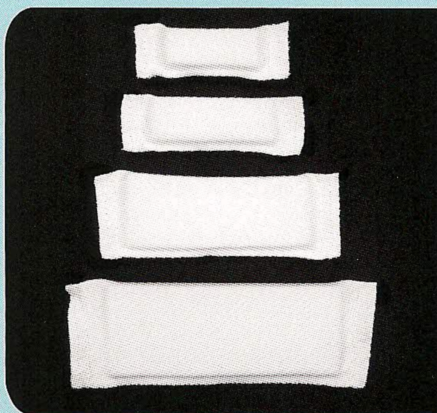
Preemie, Neonatal, Pediatric and Child-Size Armboards